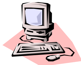
Caption describing picture or

* I strongly encourage you to attend the National Annual meeting in Concord, CA June 14–17th. It will be a great celebration to end a great year for the US JCI Sen-