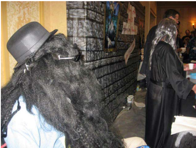
...There's Cousin It!