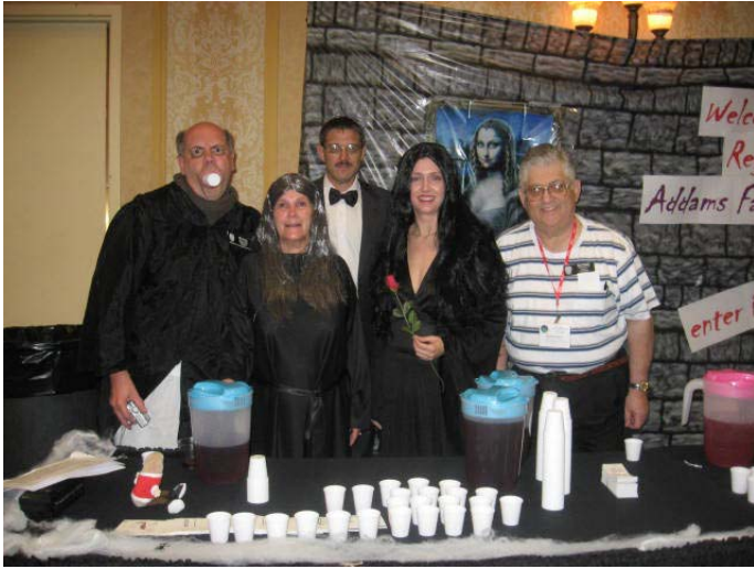
The Adam's Family, where's Cousin It?